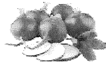
LOCALLY GROWN RED RADISHES