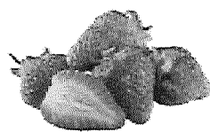
LOCALLY GROWN STRAWBERRIES