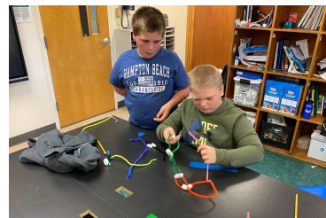
Stewartstown Students Maker Space Fun!