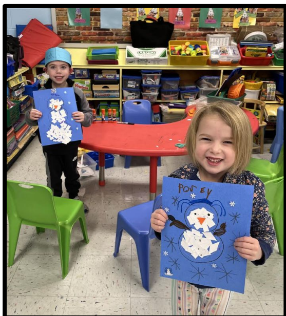
Snowmen creations in PreK 4

During the Curiosity Corner Curriculum unit "Winter Wonders" the preschool 3 and 4 classes explored the magic of the winter season. They sequenced events in the story, The Mitten and made connections to the happening in the story, The Snowy Day . The students had many fun center activities including building play-doh snowmen, building igloos and dens out of blocks, and working at the pretend coffee shop.