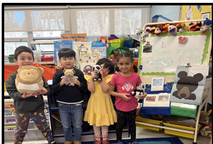
Students brought in their favorite stuffed bears to help us learn about hibernation.