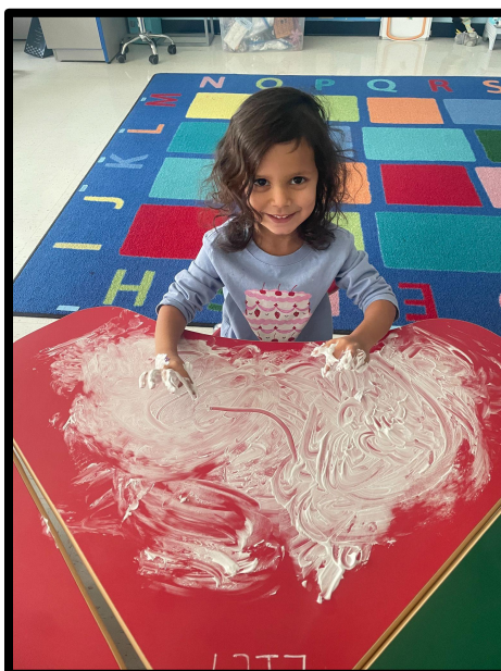
Playing with "snow"