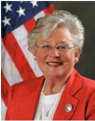
Kay Ivey, Governor President