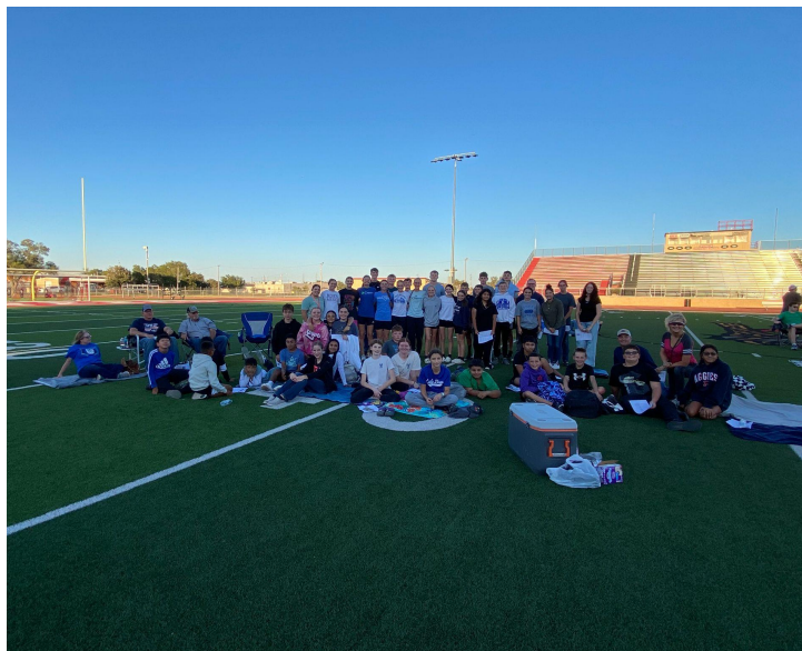
Fields of Faith

schools from surrounding areas committed their lives to Christ that night, and everyone who was there learned vital lessons about what it means to follow Jesus.