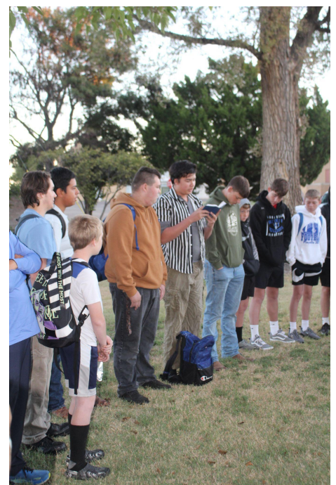
SYATP (See You at the Pole)

FCA meets once a month and encourages anyone who is interested to come! Their next meeting will be held on Wednesday, November 13.