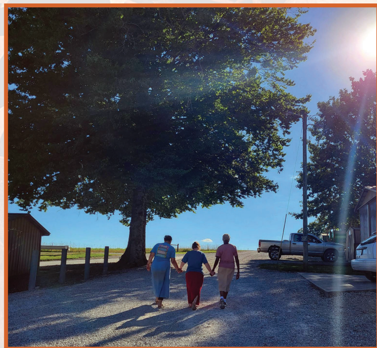
Beautiful Morning for a Walk

Our next Newsletter will be all about how our 34 th Annual Quilt Auction went! The auction will be October 7&8, 2022. Just a couple weeks from now! This is our biggest fundraiser of the year and is a favorite time around our campus. We look forward to seeing you there!