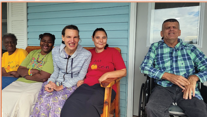
A beautiful day outside