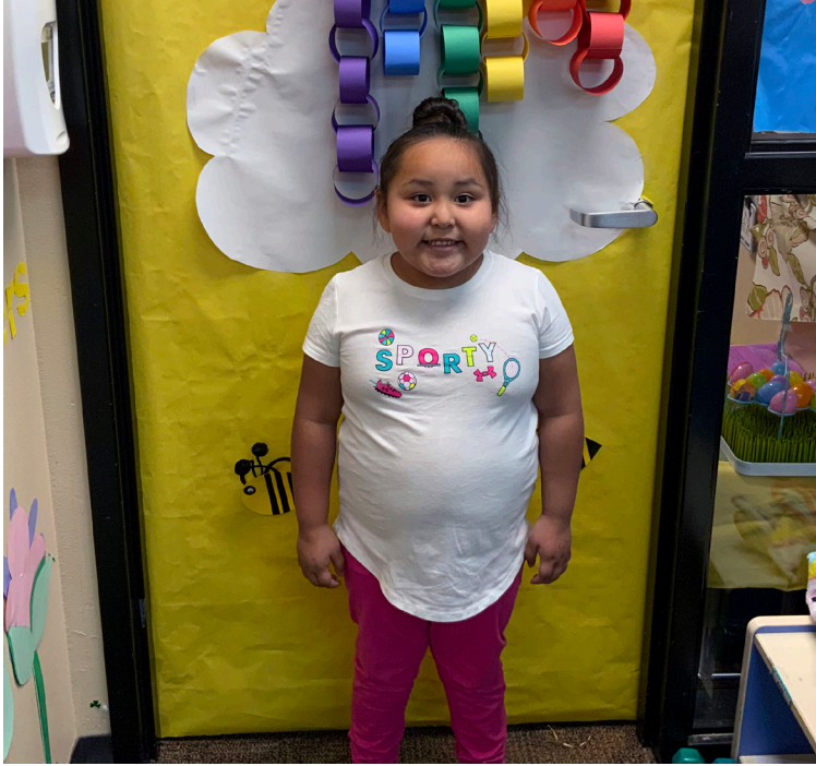
Moriah Robertson Preschool