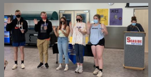
SHS THESPIAN TROUPE INDUCTION CEREMONY