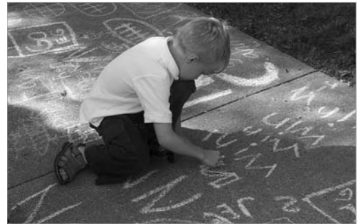
Homecoming Week photos, clockwise from top left: