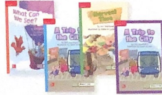
What Can We See? (Approaching), A Trip to the City (On Level, ELL), Harvest Time (Beyond)