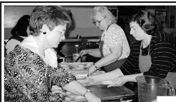
From the last issue (below):