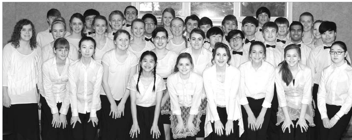
The student servers.