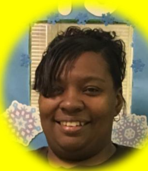
Lafayette Rounds Parent of the Month