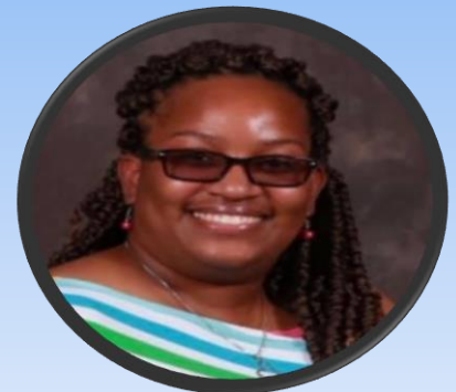
Employee of the Year