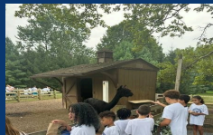
🌍 Field Trips