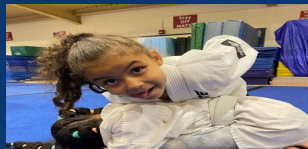
👂 On the Mat

STAFF & VOLUNTEERS Camper & parent rating · 2025