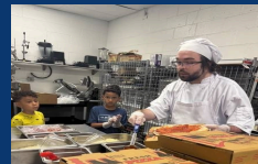
👨‍🍳 Real Chef · Pizza Day