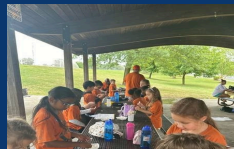
🔬 STEM & Enrichment