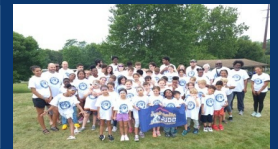
👥 Adventures Together