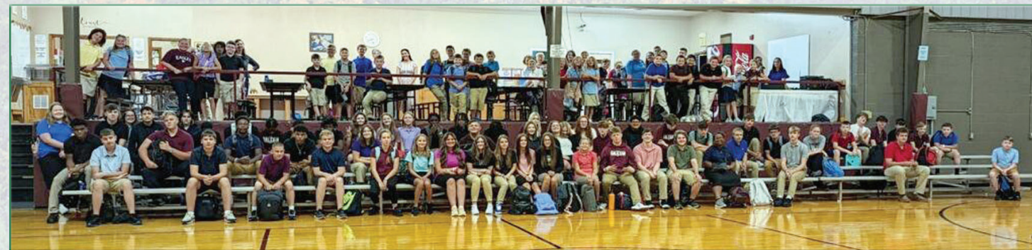
3rd - 12th Grade