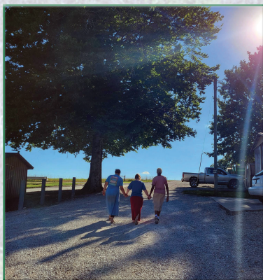
Beautiful Morning for a Walk