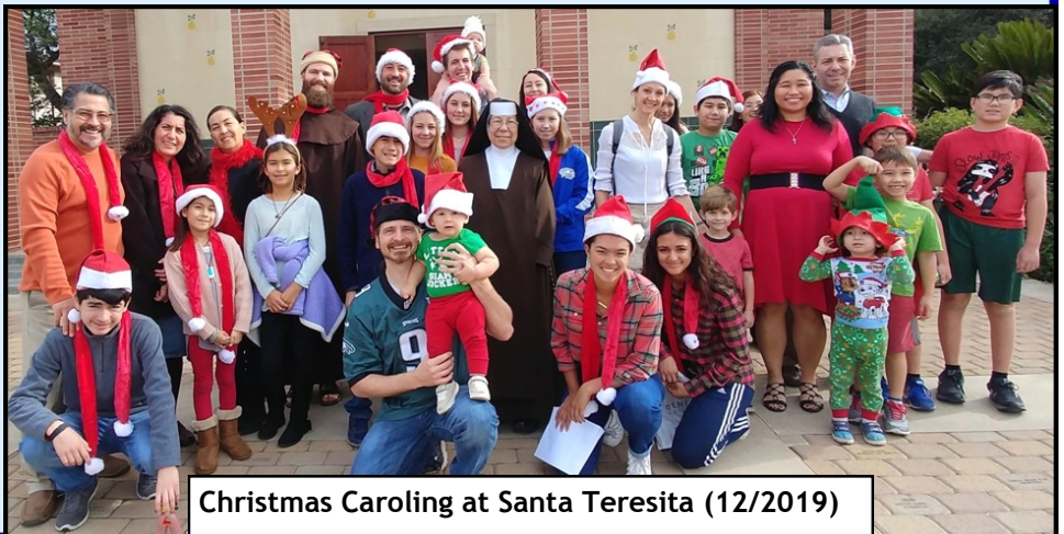
Christmas Caroling at Santa Teresita (12/2019)