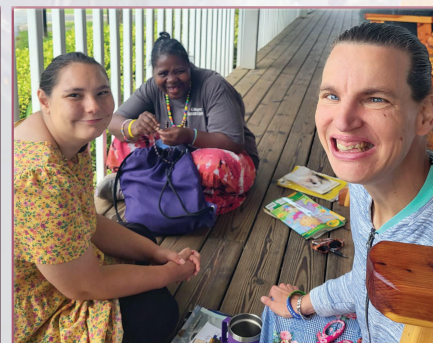
The girls enjoying the weather.