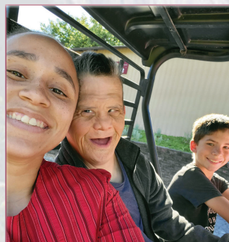
We love the mule rides!