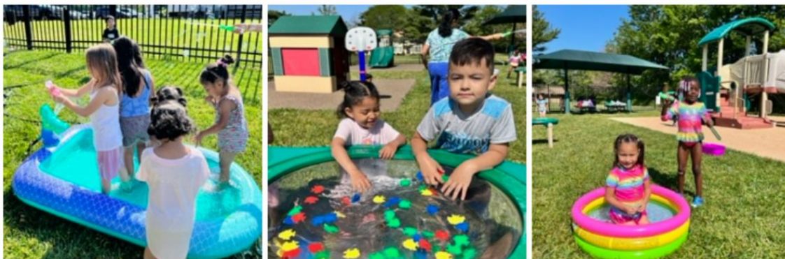
Twin Rivers Head Start held a water day at the center's playground for children to cool off while enjoying time outdoors.