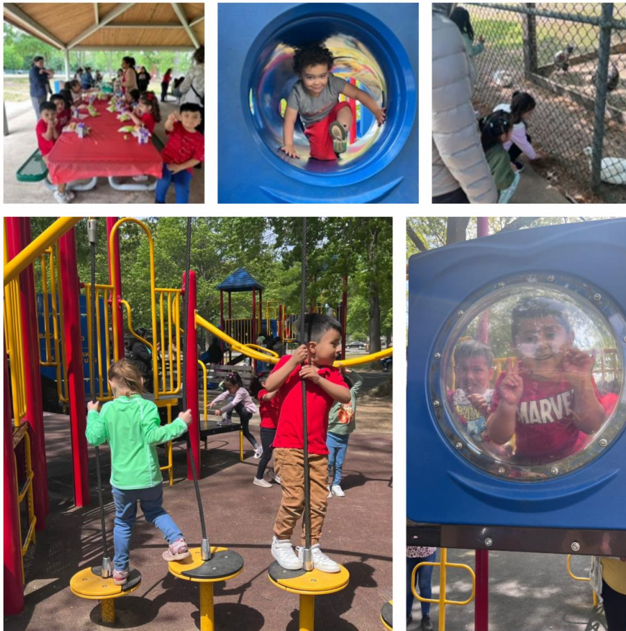
Children from Twin Rivers Head Start had fun at the Thompson Park Petting Zoo, where they had the chance to feed animals and play with their peers in the park.