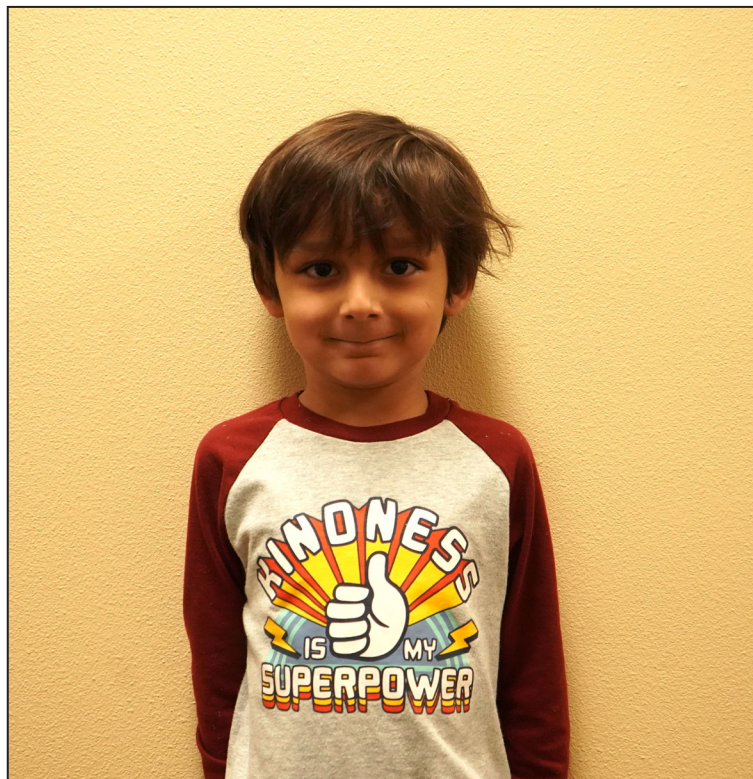
Cedric Fisk Page Preschool