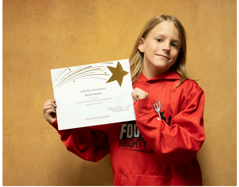
Rocky Hawker Desert View Intermediate