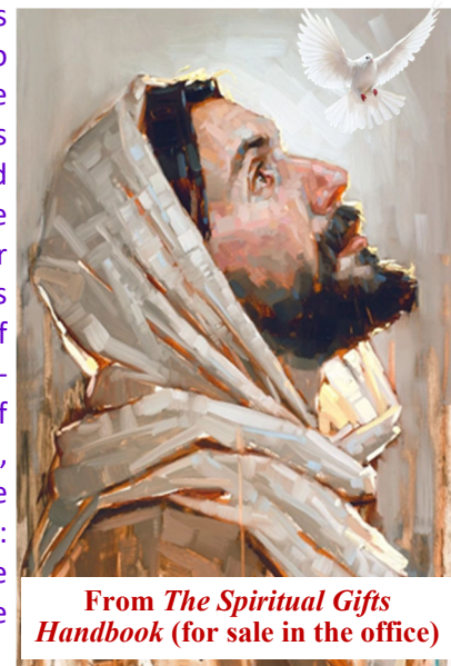
From The Spiritual Gifts Handbook (for sale in the office)

Just as Jesus' baptism in the Spirit was the foundation for His whole mission, so the baptism in the Spirit that His disciples would receive would be the foundation for their mission. As Theophilus of Antioch, a second-century father of the Church, wrote, "This is why we are called Christians: because we are anointed with the oil of God."