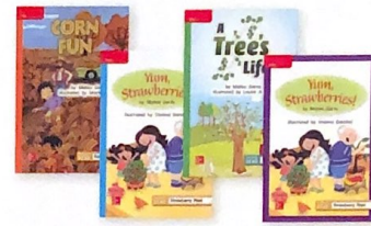
Corn Fun (Approaching), Yum, Strawberries! (On Level, ELL), A Tree's Life (Beyond)