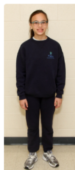
Winter Boys & Girls Gym Uniform