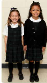
Winter Girls Uniform K-4