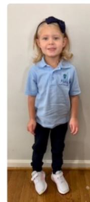
Pre-K Girls Winter Uniform