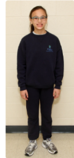
Winter Boys & Girls Gym Uniform