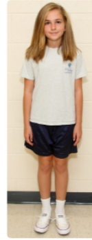
Summer Boys & Girls Gym Uniform