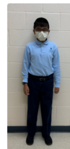
Winter Boys K-8 Belt required for 2-8