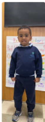
Pre-K Boys Winter