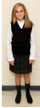
Winter Girls Uniform