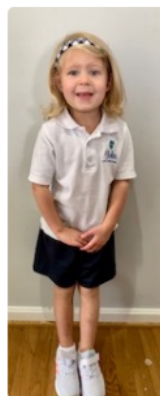
Pre-K Girls Summer Uniform