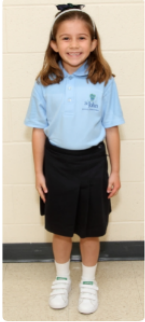
Summer Girls Uniform K-8 with Blue Polo

If girls choose to wear hair accessories, the hair accessory must be simple. (No oversized bows, such as cheer bows, large flowers, etc.)