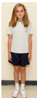
Summer Boys & Girls Gym Uniform