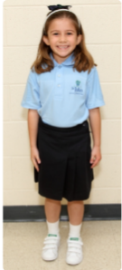
Summer Girls Uniform K-8 with Blue Polo

If girls choose to wear hair accessories, the hair accessory must be simple. (No oversized bows, such as cheer bows, large flowers, etc.)