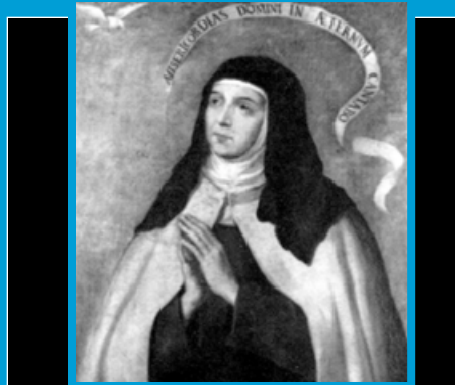
St. Teresa of Jesus (of Avila) Feast Day: October 15 (March 28, 1515—October 4, 1582)