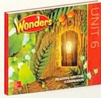
"Share the Harvest and Give Thanks" pp. 132-144