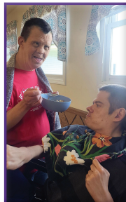
Jimmy Loves to Help Out

GALILEAN CHILDREN'S HOME PO BOX 880 LIBERTY, KY 42539-0880