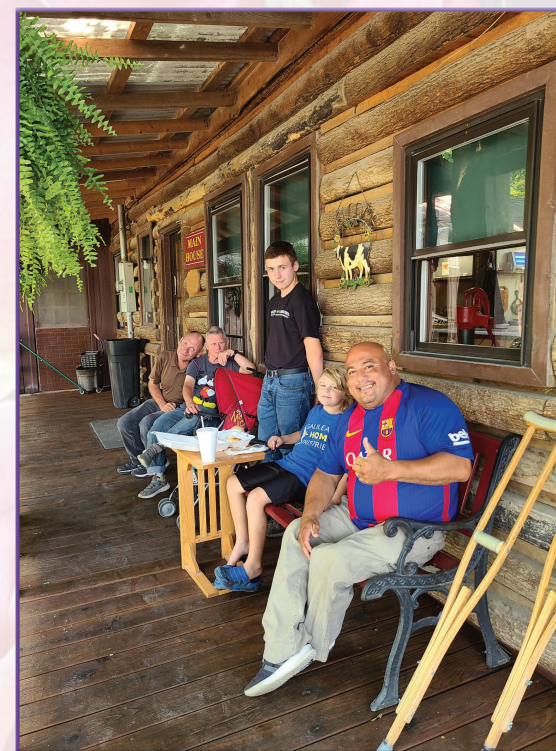
Family and Residents Enjoying the Day

What a HUGE blessing we received recently when a work team of 30 people from Pennsylvania stayed with us a whole week. Boy did they get a lot done! From cleaning up around the property to prep work for quilt