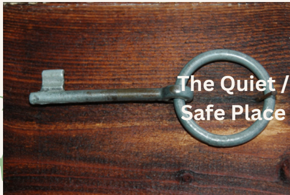
The Quiet / Safe Place