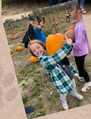
Field trip fun!!