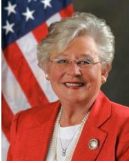
Kay Ivey, Governor President