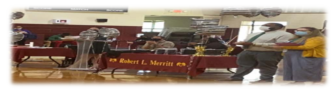
9<sup>th</sup> Grade Promotion Ceremony Tuesday, May 17, 2022 6:00 p. m. at Merritt