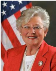
Kay Ivey, Governor President