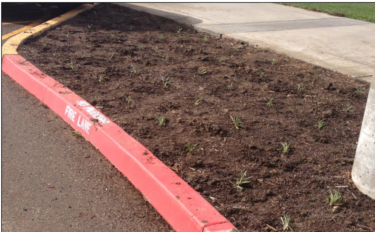
PVHS – Circular Drive Groundcover Replacement