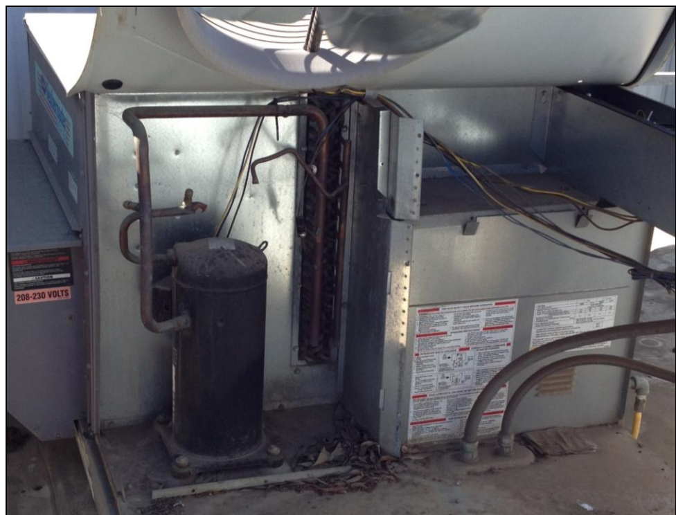
SMHS – Copper Stolen From Rooftop HVAC Unit