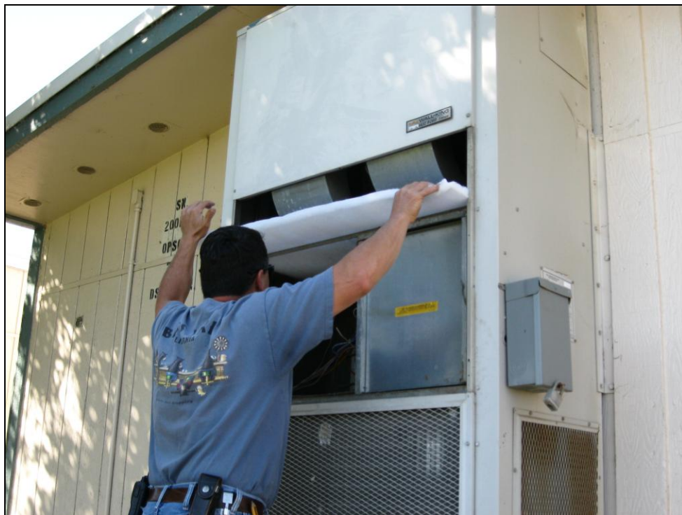
ERHS – Installation of new Foam Air Filters (Trial)