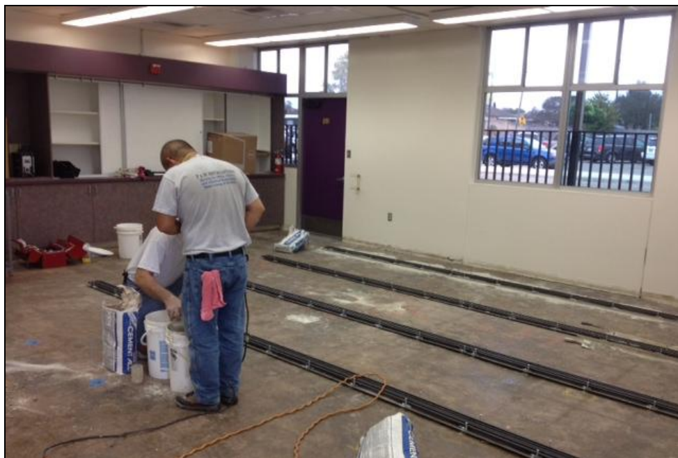
ERHS – Rolling Tracks Installed for Mobile Textbook Storage