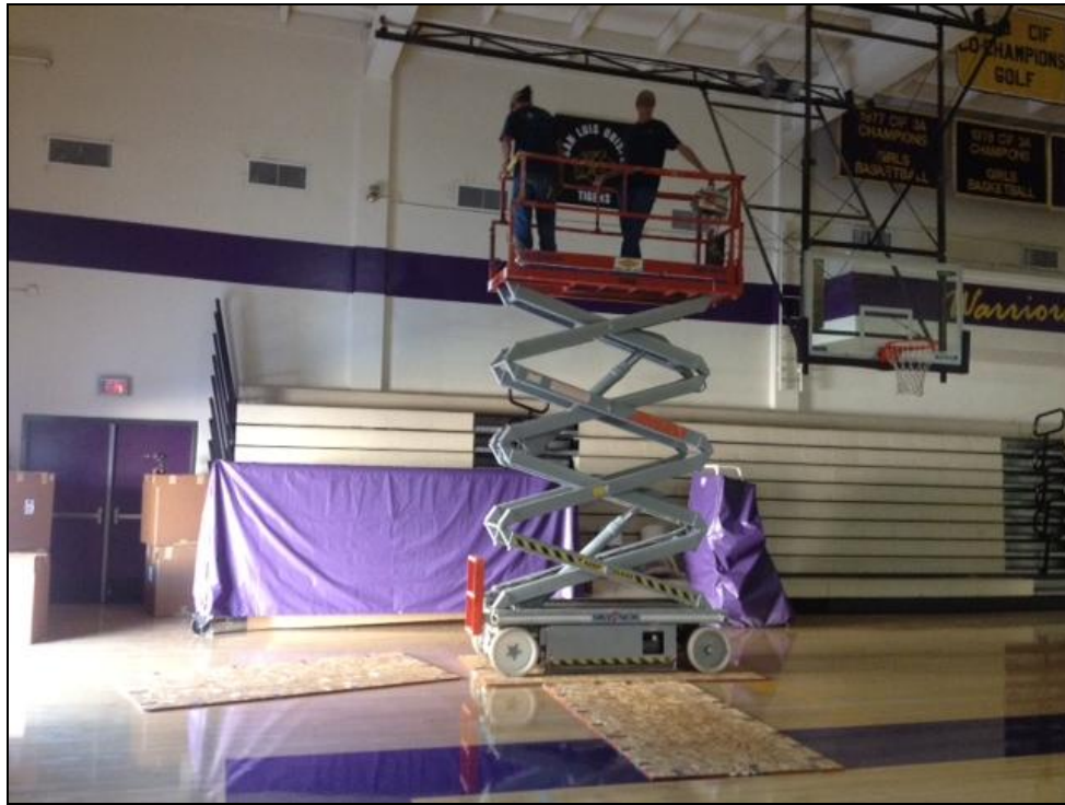
ERHS – Gymnasium Lighting Installation Underway