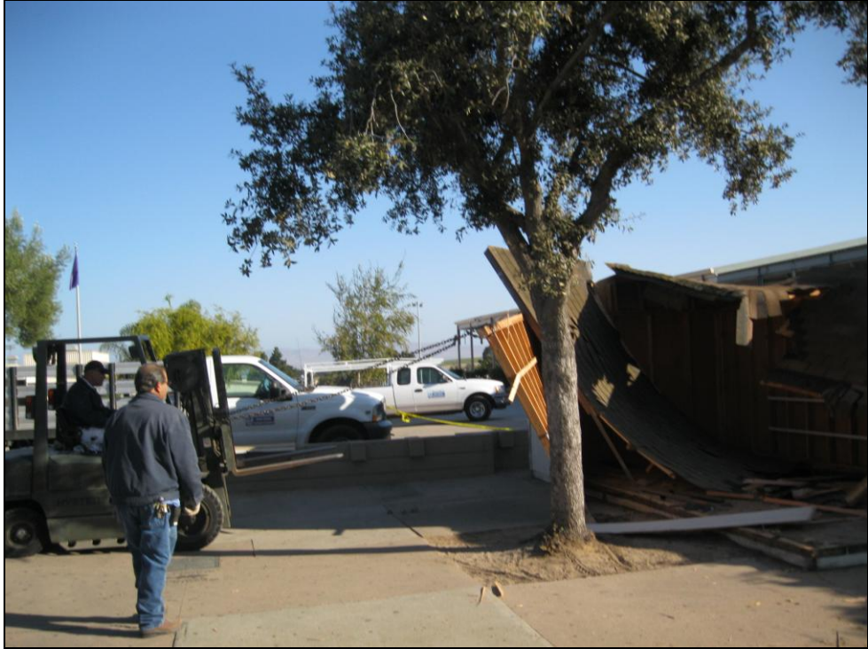
ERHS – ASB Storage Shed Removal