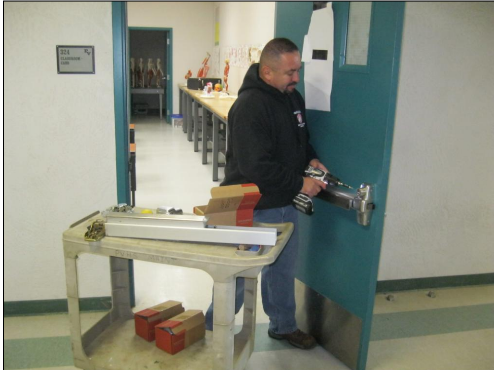
PVHS – Intrusion Lock Conversion In-progress