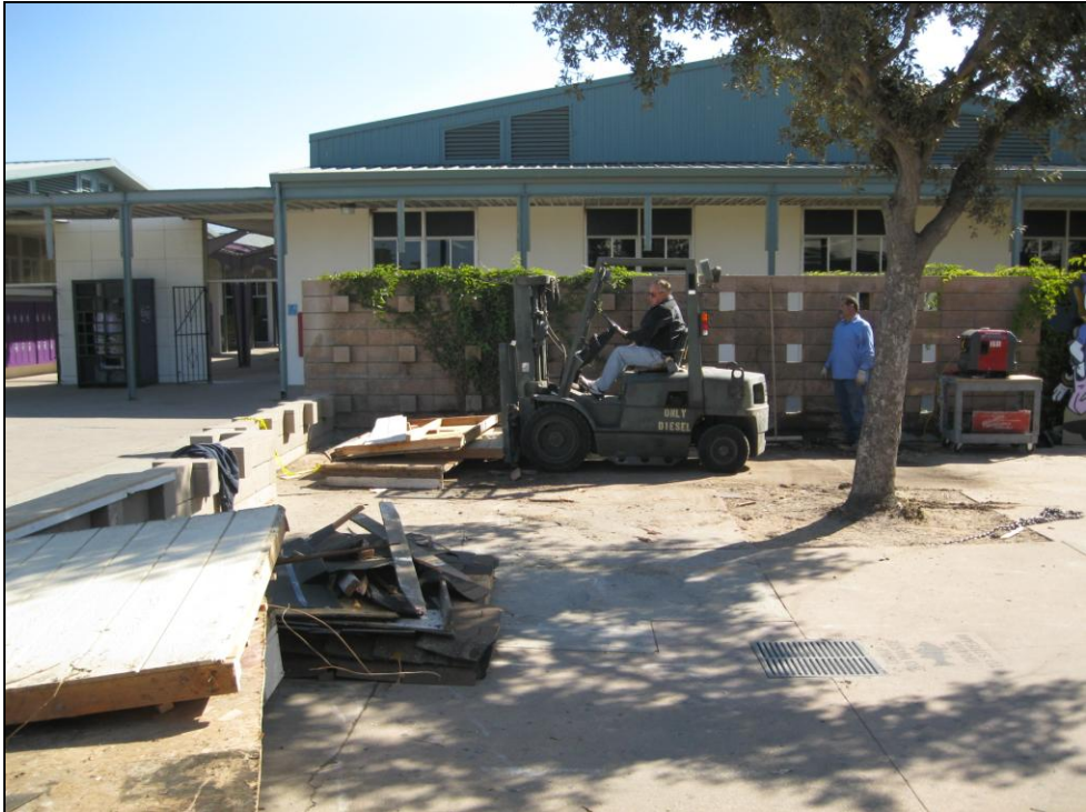
ERHS – ASB Shed Debris Clearing