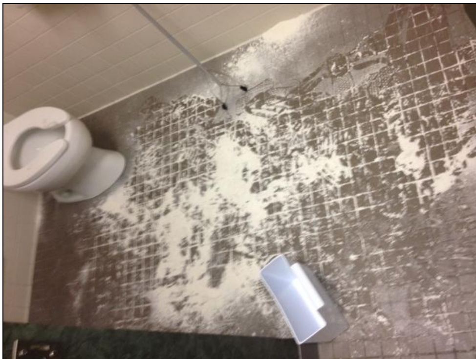
ERHS – Baking Flour Clean-up in Student Restroom