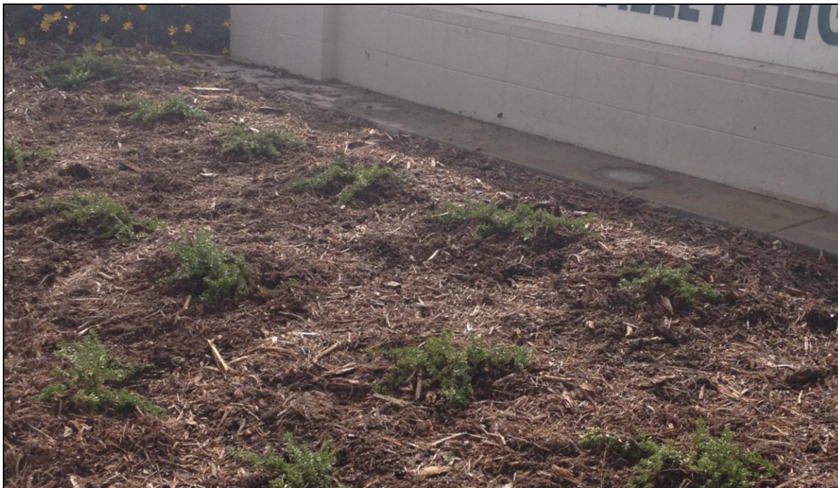
PVHS – Replanted Groundcover at the School Sign