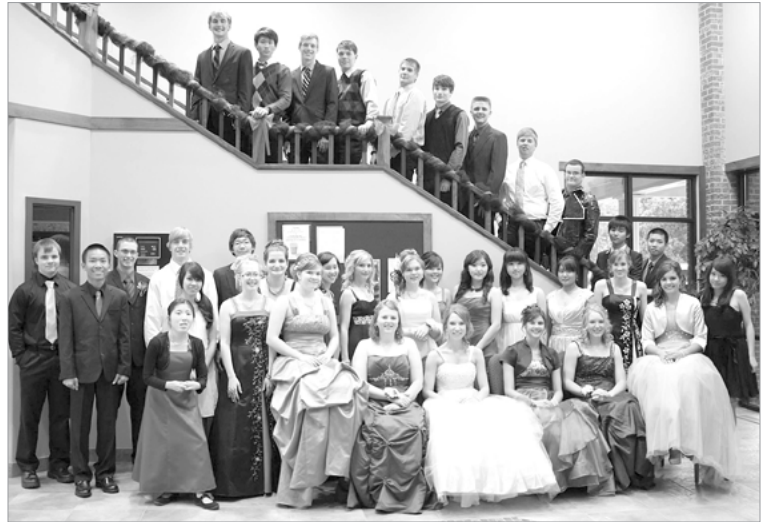
Above: The Junior class at Honor Banquet.

After winning the Goldenrod Conference Quiz Bowl and placing second at the ESU 7 District competition, the NC quiz bowl team boldly went where no NC quiz bowler had gone before: the state competition. This competition, put on by the state Educational Service Unit, was comprised of the top two teams from each ESU. The NC team beat Silver Lake in the first round, lost to Syracuse in the second, beat Hemingford in the