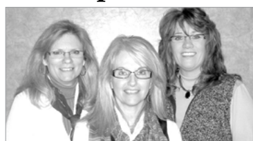
Above: NC's student servers for the 2012 Dinner & Benefit Auction.

We are pleased to report that God has chosen to pour out his blessing on NC by once again moving on the hearts of many very generous donors to give to the Dinner and Benefit Auction. While final figures are not yet available, it appears that we will have a net profit from the event of well over $180,000. Over 350 donors contributed to the success of this event along with approximately 100 willing volunteers.