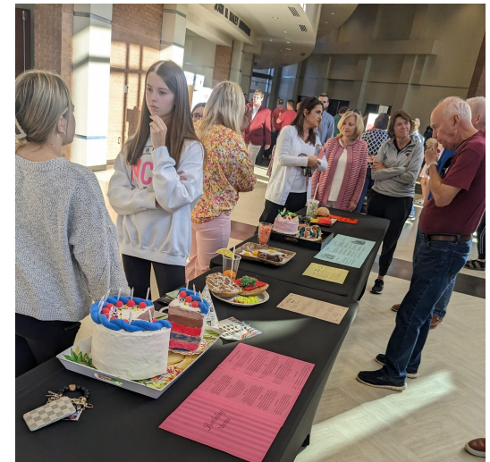
Students showcasing their PBL's with parents and staff for Coffee FLEX & PBL Showcase Night.