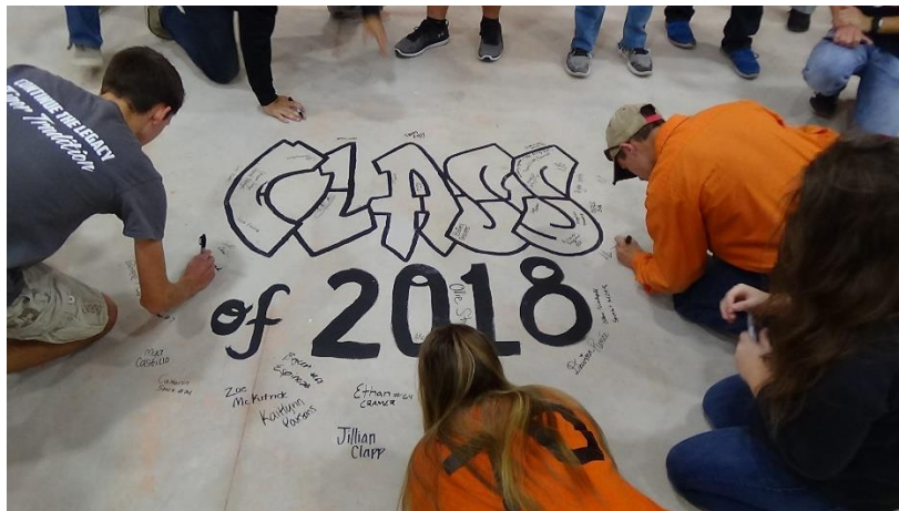
(Pictured above are members of the senior class signing the gym floor)

The time is certainly flying by quickly and the finishing touches to the new K-12 building are coming to completion. On September 28 th , the wood flooring for the gymnasiums was delivered to the site. The following day, September 29 th , all students were provided the opportunity to write their signature on the concrete in both the elementary and the middle school gymnasiums that will soon be covered by the wood flooring. In fact, September 29 th was the only day we could allow this opportunity because the installation of the wood flooring was scheduled to begin on October 2 nd . This activity will be remembered for decades to come.