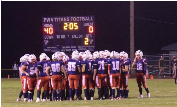
With a huge lead just before halftime, the football team huddles during a time out.