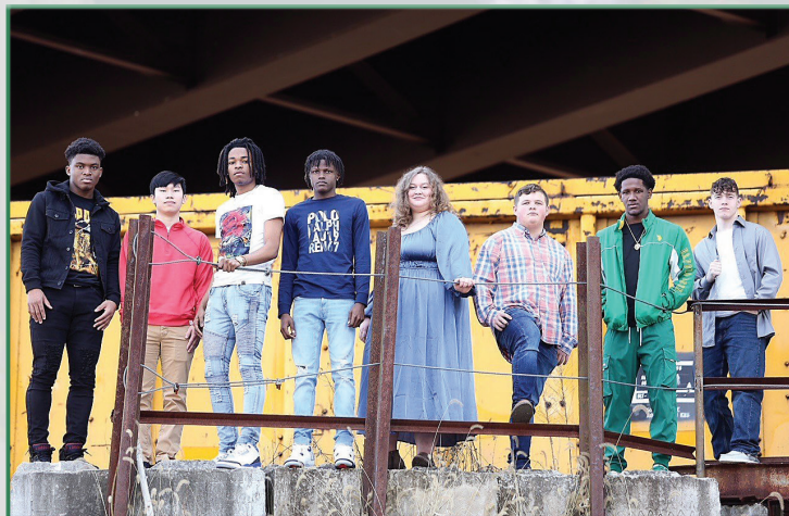
GCA 2023 Graduating Class