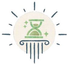
EXPLICIT INSTRUCTION, INTERVENTIONS, & EXTENSIONS