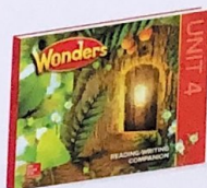
"A Team of Fish" pp. 42-51