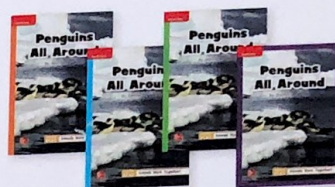
Penguins All Around (Approaching, On Level, Beyond, ELL)