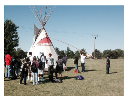
AHS Students learning how to set up the Kiowa tipi under the instruction of Randy & Glenda Palmer.