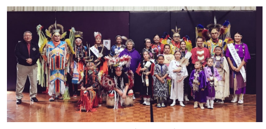
Anadarko Indian Education Dance Troupe

The Anadarko Indian Education Program is a comprehensive program that utilizes supplemental academic assistance, cultural perpetuation, community involvement, and student development projects to meet the unique educational needs of American Indian students.