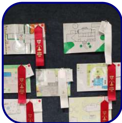
Ribbons won from Georgia National Fair Winners.