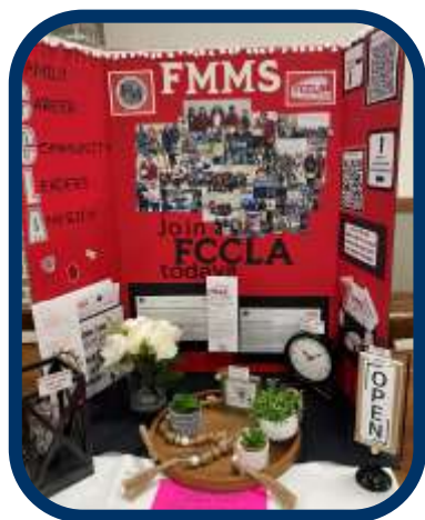
FMMS - 2nd Place Membership Recruitment Board