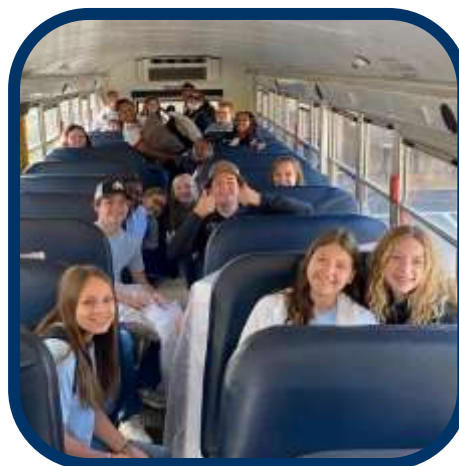
FMMS and MCMS bus ride to FCCLA Fall Leadership Conference.