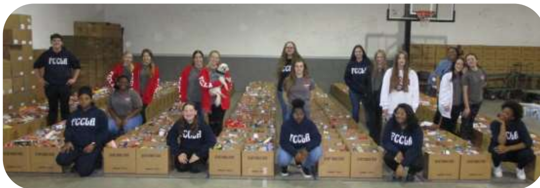
Pictured above are all FCCLA chapter members in attendance to help pack the boxes.

Perry High FCCLA's part in this program was to provide 1500 boxes of macaroni and cheese. Perry High FCCLA encouraged the entire school to participate in this macaroni and cheese drive. The faculty, staff and students collected over 2,000 boxes of macaroni and cheese. The total collected exceeded expectations for the school.