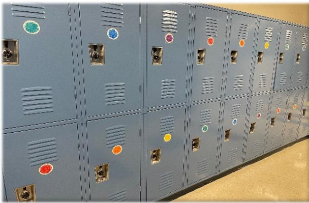
Lockers were colored-coded for social distancing. Students are called by "color" to their lockers