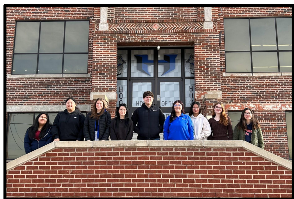
The Hooker Happenings Staff

Thank you so much to the school and community for supporting The Hooker Happenings! Bringing you the news has been an honor. There will be no papers throughout the summer, but we will start publishing again once we return to school in the fall. See you then!