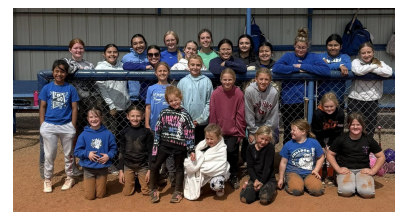
Softball and Baseball Camps