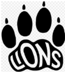
Level Cross Elementary School

RCSS Teaching and Learning: A Tiered System of Support for all Students Proudly Featuring Instructional Highlights From: