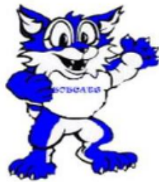
New Market Elementary School