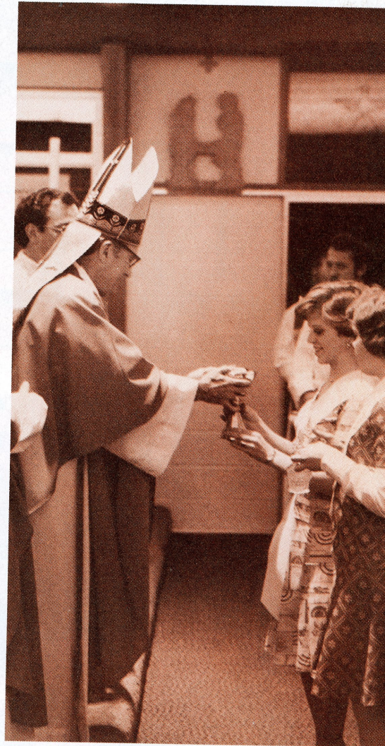
Two of the candidates for Confirmation offer the gifts to Bishop Vath.