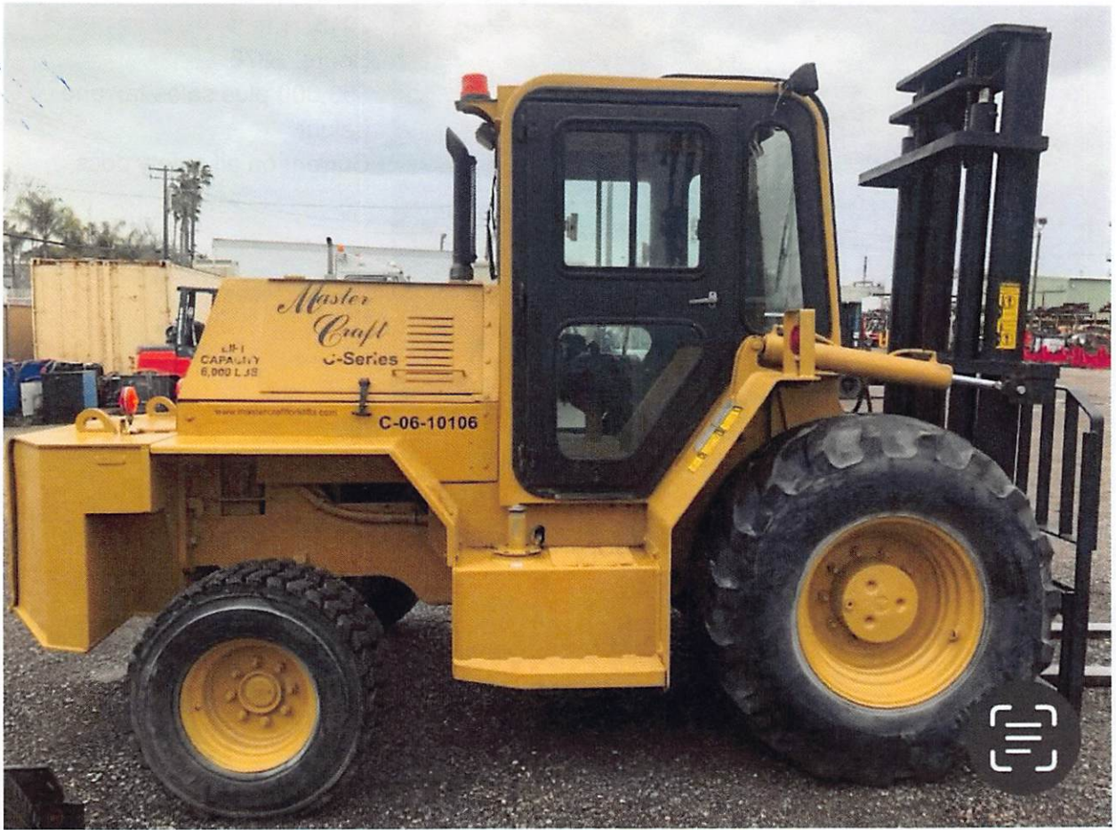
Master Craft, 2013, 2 wheel drive diesel, 7467 hours, $35,500 plus tax, 6k lbs lift capacity