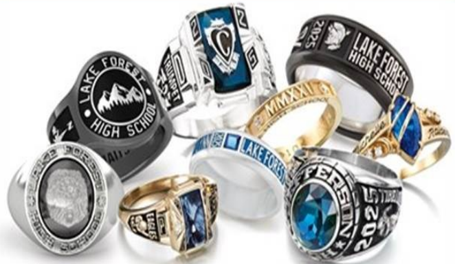
Class Rings - Letter Jackets - Senior Gear

Promotion Code: SENIORGIFT40 (some exclusions apply)