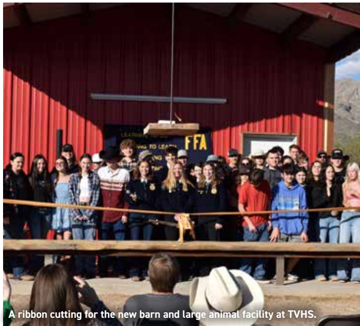
A ribbon cutting for the new barn and large animal facility at TVHS.