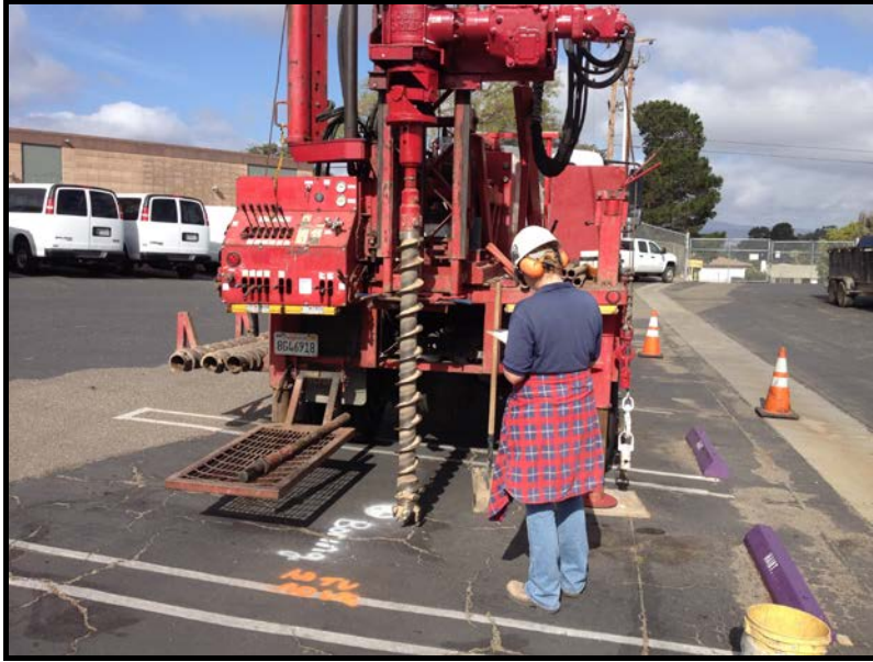
ERHS: 38 Classroom Building Soils Testing and Site Layout