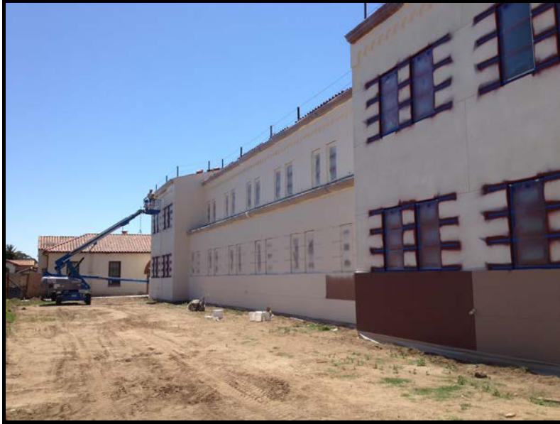
SMHS: New 14 Classroom Building