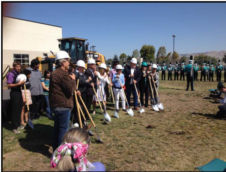
PVHS: PAC Groundbreaking Ceremony