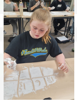
Fourth grade got messy with shaving cream, while learning how to change improper fractions to mixed numbers.