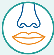
New loss of taste or smell