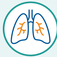
Shortness of breath or difficulty breathing