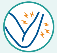
Muscle or body aches