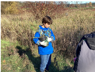
Have a great weekend!